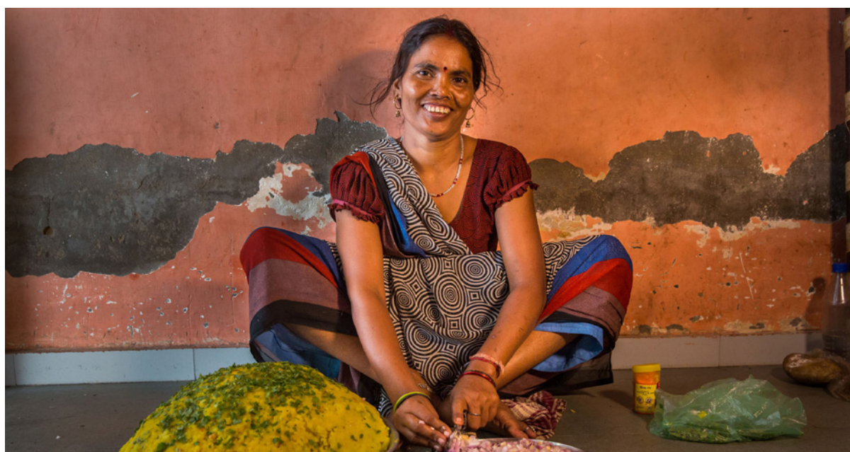
On average, the latest health-care visit for a domestic worker in Delhi cost the equivalent of three-quarters of a week's average earnings.