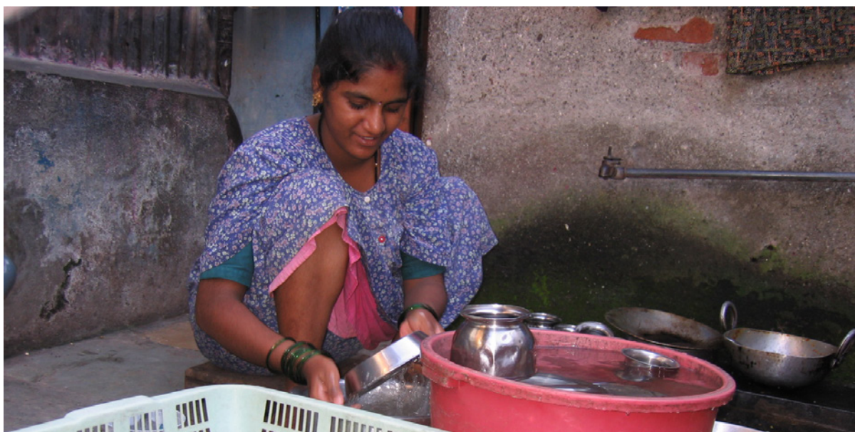
Domestic workers in Delhi are not registered under the social security authority. This has resulted in their exclusion from emergency cash grants, which have been extended to registered groups of unorganized sector workers, such as construction workers.